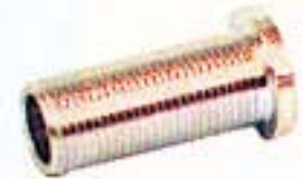
Speed board shaft bushing