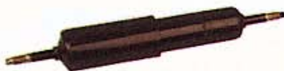
Front shock absorber