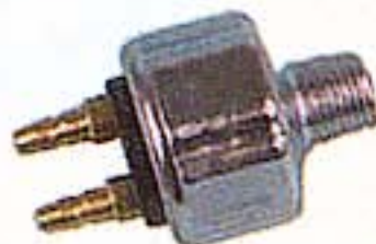
Brake light switch for cars with hydraulic brakes