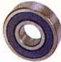
Rear axle bearing