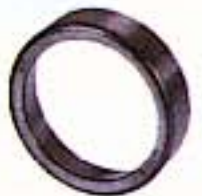
Bearing cup. Makes #3701 w/#3731

3751 - $ 15.00 OEM #593793 / #LM-11949, LM-11910