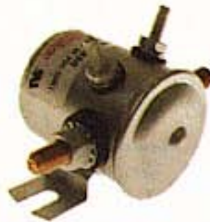
#71 series. 12-volt, 4 terminal with copper contacts. Long housing