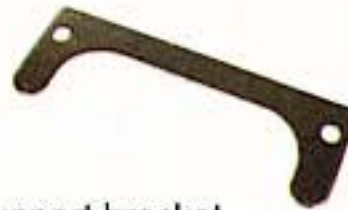
F&R support bracket