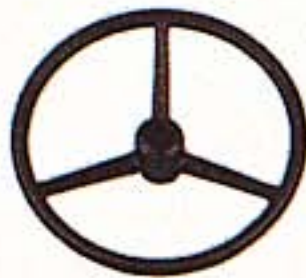
Steering wheel with plastic cap