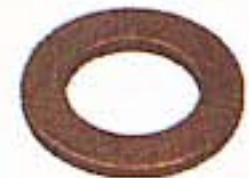
Spindle thrust washer

628 - $ 3.80 For 1981-up 4 wheel cars OEM #556024