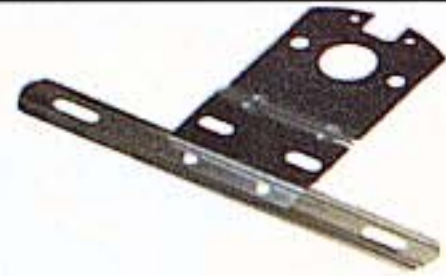
License plate bracket, heavy gauge plated steel

2441 - $ 10.00 Universal applications OEM #327337