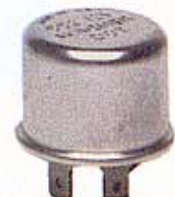
Heavy duty flasher, 12-volt