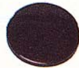
Center cap only for #4632