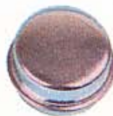
Spindle dust cover 2" O.D.

628 - $ 3.80 For 1981-up 4 wheel cars OEM #556024