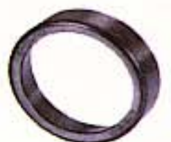
Reel bearing cup