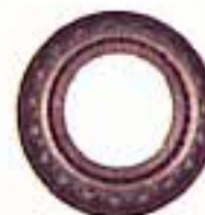
Fork stem bearing cone