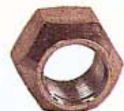
Wheel lug nut. ½"-20