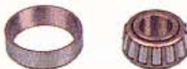
Wheel bearing set #2

3751 - $ 15.00 OEM #593793 / #LM-11949, LM-11910