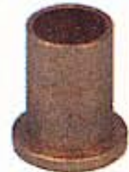
Idler flange bushing

629 - $ 6.00 For 1981-up 4 wheel cars OEM #555933