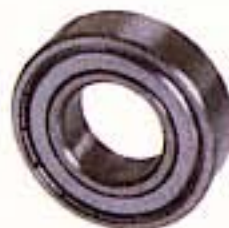
Differential bearing set #6

3752 - $ 22.00 OEM #500535 / #LM-67048, LM-67010