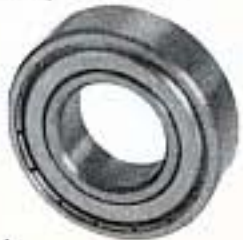
Axle roller bearing set

3709 - $ 82.00 OEM #593793 / #U-199, U-160L