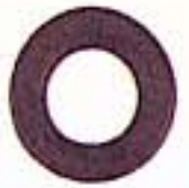
Rear axle oil seal