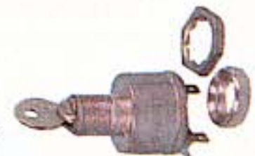
Key switch with 2 spade terminals and 2 #1919 keys