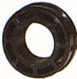
Steering tube bushing