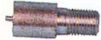
Accelerator board switch stop