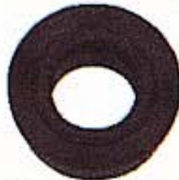
Steering tube bushing & seal assembly

629 - $ 6.00 For 1981-up 4 wheel cars OEM #555933