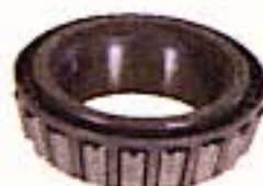
Reel bearing cone