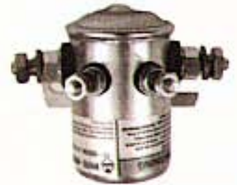
#70 series. 12-volt, 4 terminal with copper contacts. Short housing