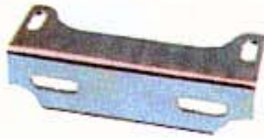
F&R mounting bracket