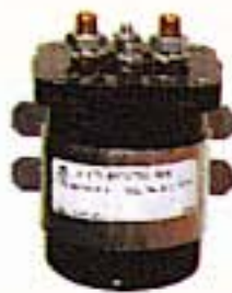
#586 series. 36-volt, 4 terminal with silver contacts 200 amp continuous, 600 amp peak