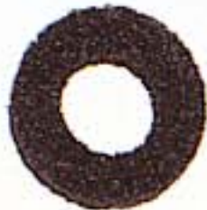
Steering tube dust cover