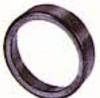
Fork stem bearing cone

3752 - $ 22.00 OEM #500535 / #LM-67048, LM-67010