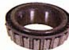
Bearing cone. Makes #3701 w/#3731