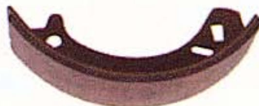
Replacement brake shoes with 2 short linings 1 3/4" x 5 1/2" and 2 long 1-1/3" x 7"