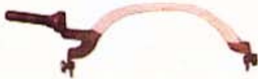
Copper crossover without insulating pad