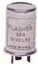
#550 12-volt, 3 terminal flasher