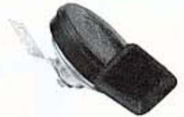
12-volt horn with one terminal