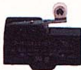
Roller arm micro switch