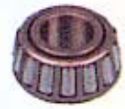
Wheel bearing set