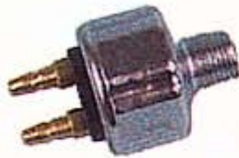
Brake light switch