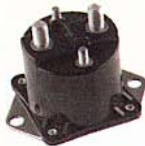
Prestolite. 36-volt, 4 terminal with copper contacts