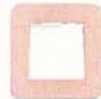
Insulating bushing with .335 hole and .227 thick