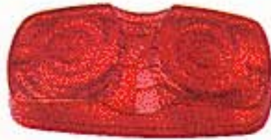
4" x 2" red taillight lens