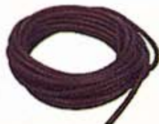
5/16" rubber fuel hose