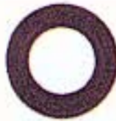
Front wheel seal