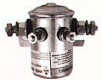
#70 series. 12-volt, 4 terminal with copper contacts. Short housing