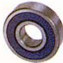
Rear axle bearing, Terrell