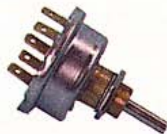
5 terminal speed control switch