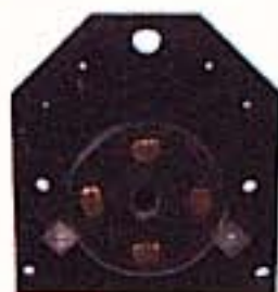
F&R contact board