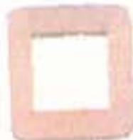
Insulating bushing with .335 hole and .345 thick