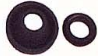
Torque spider repair kit Includes 2-boots and 2-cups