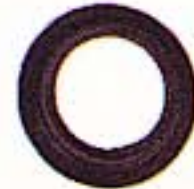
Rear axle seal, Terrell