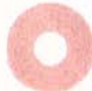
Fiber washer with .330 hole