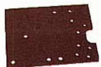
Speed switch board. 5-7/8" x 4 1/4" x 1/4"