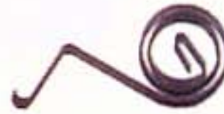
Motor brush spring