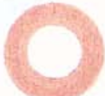
Fiber washer with .425 hole