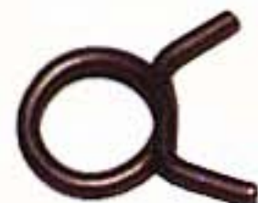
5/16" fuel clamp