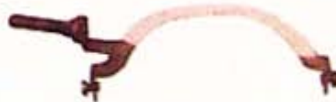
Copper crossover with insulating pad