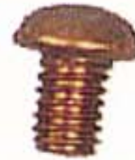
10-32 x 1/4" brass pan head screw