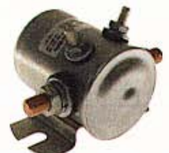
#70 series. 36-volt, 4 terminal with silver contacts and short housing