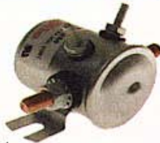
#70 series. 12-volt, 4 terminal with copper contacts. Long housing