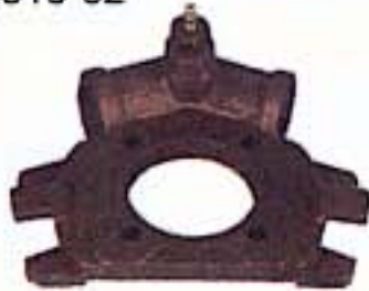
Bendix type torque spider