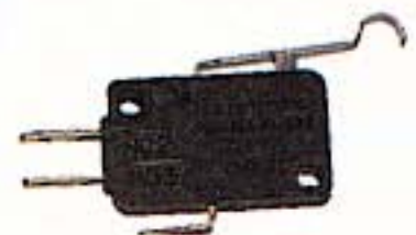
3 terminal micro switch