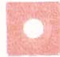
Fiber washer with .330 hole