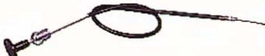
26" choke control cable