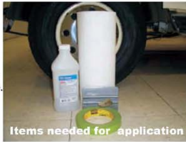
Items needed for application

Wash and dry the unit thoroughly. Using paper towel,(not shop towels) wipe the complete surface down using isopropyl alcohol. The cleaner the surface the more successful the application will be. Taking your time on surface prep will insure better adhesion to the golf car.